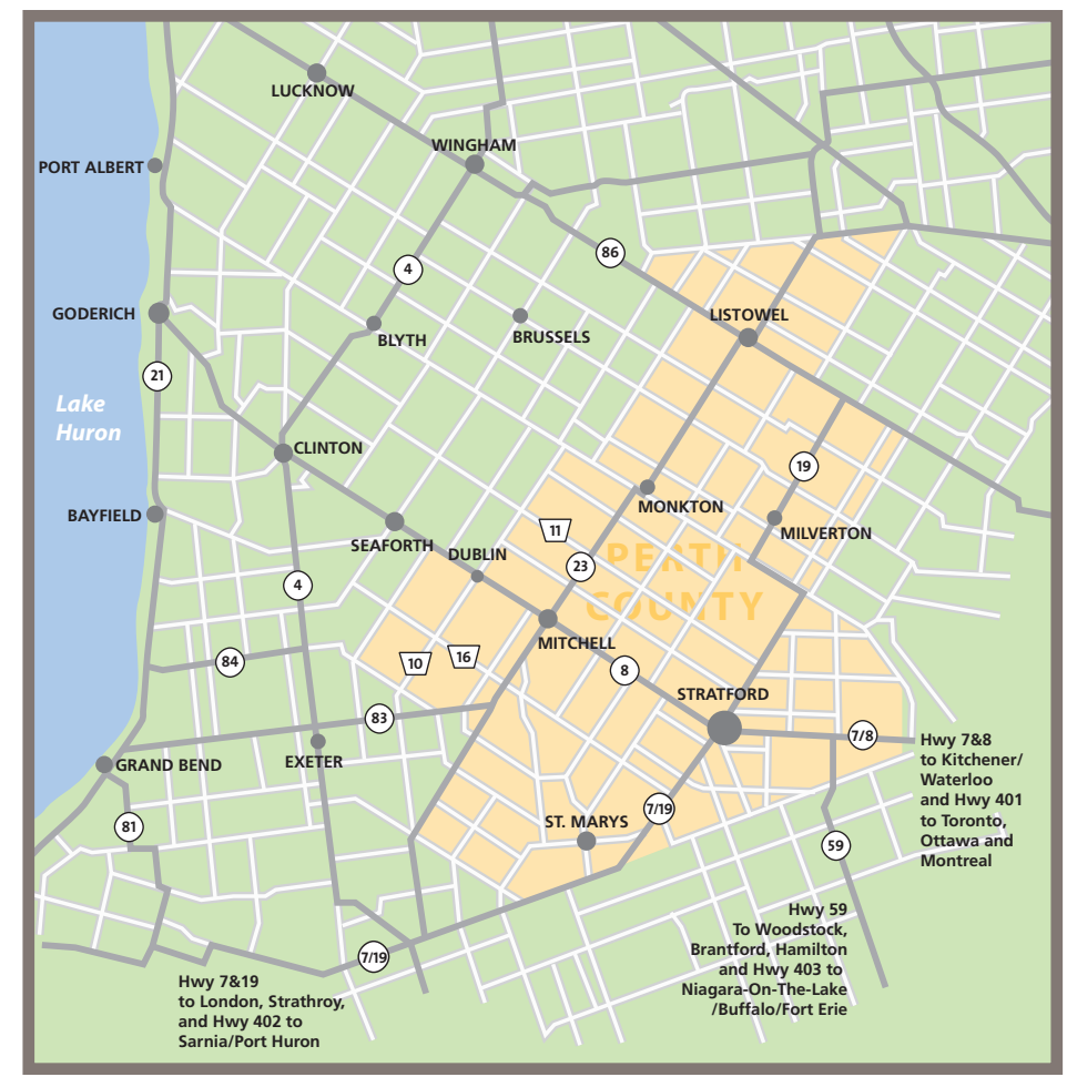
www.visitperth.ca pull-out map

If you enjoy cycling, you'll love this map! Six cycling routes around Perth County in a downloadable pdf. www.visitperth.ca/maps.html