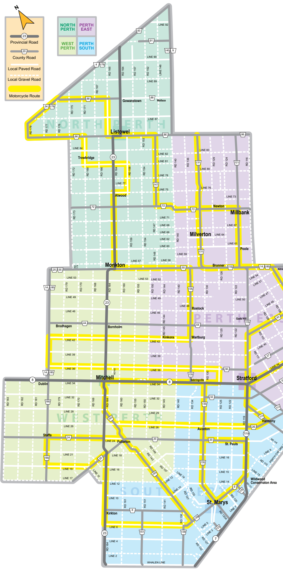
Perth County Motorcycle Map | www.visitperth.ca